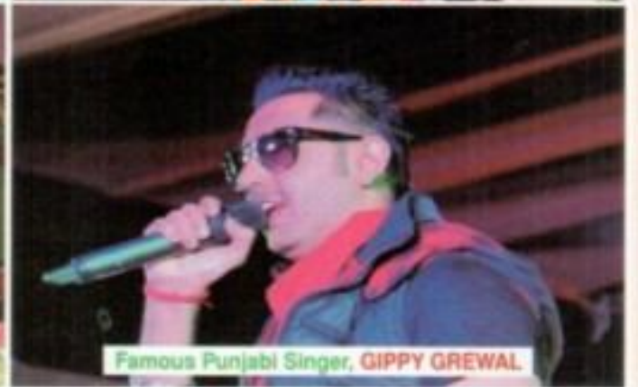
Famous Punjabi Singer, GIPPY GREWAL